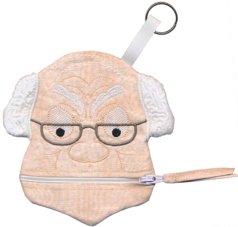
19999-027 In the Hoop Zip It Grumpy Man Pouch 5.12 X 5.20 in. 130.05 X 132.08 mm 8,635 St. L

Note: Some designs in this collection may have been created using unique special stitches and/or techniques. To preserve design integrity when rescaling or rotating designs in your software, always rescale or rotate designs using the handles directly on-screen.