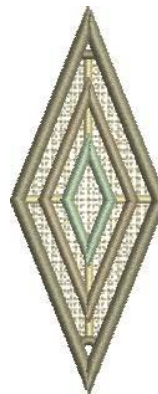
12520-04 Diamond Dangler FSL 1.32 X 3.26 in. 33.53 X 82.80 mm 5,024 St. S