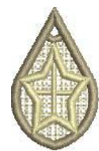
12520-09 Teardrop Dangler FSL .91 X 1.51 in. 23.11 X 38.35 mm 2,200 St. S