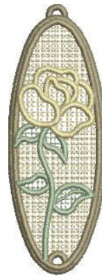
12520-02 Rose Dangler FSL 1.18 X 3.27 in. 29.97 X 83.06 mm 7,112 St. S