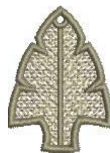
12520-08 Arrowhead Dangler FSL 1.09 X 1.53 in. 27.69 X 38.86 mm 2,467 St. S