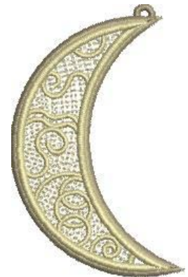
12520-05 Moon Dangler FSL 1.73 X 2.71 in. 43.94 X 68.83 mm 5,107 St.