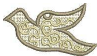
12520-07 Bird Dangler FSL 2.01 X 1.12 in. 51.05 X 28.45 mm 3,359 St. S