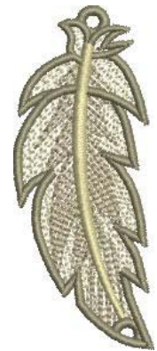
12520-03 Feather Dangler FSL 1.24 X 3.01 in. 31.50 X 76.45 mm 5,698 St. S