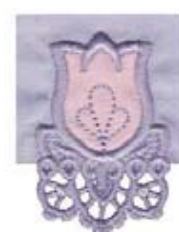
FB414_48 Freestanding Lace Tulips Applique Edging Piece 2.31 X 2.01 in. 58.67 X 51.05 mm 5,159 St. ☼☼