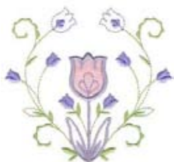
FB405_48 Tulip Applique 4.26 X 3.97 in. 108.20 X 100.84 mm 7,432 St. ☼