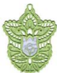
FB407_48 Freestanding Lace Tulip Applique Ornament 2.80 X 3.51 in. 71.12 X 89.15 mm 17,024 St. ☼☼