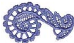
FB422_48 Freestanding Lace Mini 2.06 X 1.33 in. 52.32 X 33.78 mm 4,479 St. ☼☼ S