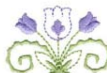
FB418_48 Tulips Accent 1.94 X 1.30 in. 49.28 X 33.02 mm 2,001 St. ☼ S