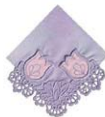
FB413_48 Freestanding Lace Tulips Applique Edging Corner 4.37 X 2.79 in. 111.00 X 70.87 mm 16,576 St. ☼☼