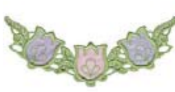
FB417_48 Freestanding Lace Tulips Applique Neckline 2 4.92 X 2.17 in. 124.97 X 55.12 mm 10,111 St. ☼☼