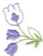
FB420_48 Tulips Accent Mini 1.13 X 1.51 in. 28.70 X 38.35 mm 1,022 St. ☼ S