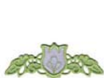
FB410_48 Freestanding Lace Tulip Applique Border Small 3.54 X 1.40 in. 89.92 X 35.56 mm 6,322 St. ☼☼ S