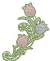
FB415_48 Freestanding Tulips Applique Lace 4.01 X 4.91 in. 101.85 X 124.71 mm 17,322 St. ☼☼