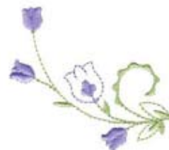
FB419_48 Tulip Accent Spray 2.53 X 2.23 in. 64.26 X 56.64 mm 1,848 St. ☼