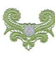
FB408_48 Freestanding Lace Tulip Applique Pocket 4.34 X 3.39 in. 110.24 X 86.11 mm 21,580 St. ☼☼