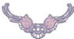
FB416_48 Freestanding Lace Tulips Applique Neckline 1 6.12 X 3.10 in. 155.45 X 78.74 mm 15,239 St. ☼☼ L