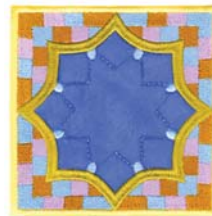
FA688 Sun 2 3.90 X 3.90 in. 99.06 X 99.06 mm 18,994 St.