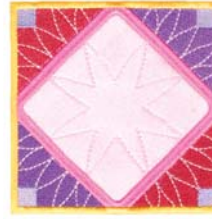
FA672 Blossom 3.92 X 3.92 in. 99.57 X 99.57 mm 15,372 St.