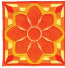
FA671 Flower 3.90 X 3.90 in. 99.06 X 99.06 mm 20,637 St.