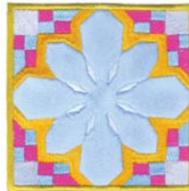
FA680 Snowflake 3.92 X 3.92 in. 99.57 X 99.57 mm 16,174 St.