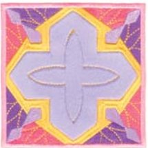
FA682 Arrows 3.91 X 3.90 in. 99.31 X 99.06 mm 19,101 St.