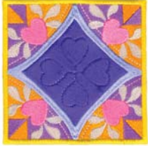
FA674 Hearts 3.91 X 3.92 in. 99.31 X 99.57 mm 24,848 St.