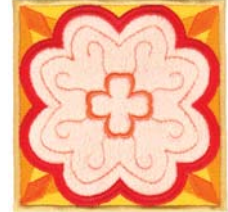
FA677 Shamrock 3.90 X 3.90 in. 99.06 X 99.06 mm 14,705 St.