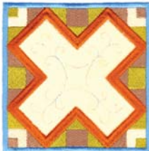
FA679 Cross 3.90 X 3.90 in. 99.06 X 99.06 mm 18,103 St.