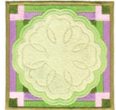
FA685 Blossom 2 3.90 X 3.90 in. 99.06 X 99.06 mm 17,435 St.