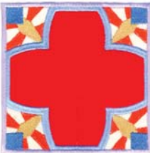
FA683 Patriotic 3.90 X 3.90 in. 99.06 X 99.06 mm 16,386 St.