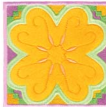
FA684 Summer 3.90 X 3.88 in. 99.06 X 98.55 mm 18,227 St.