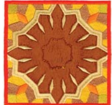
FA681 Snowflake 2 3.90 X 3.90 in. 99.06 X 99.06 mm 19,119 St.