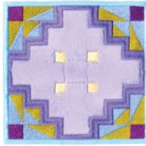
FA675 Southwest 3.90 X 3.90 in. 99.06 X 99.06 mm 16,351 St.