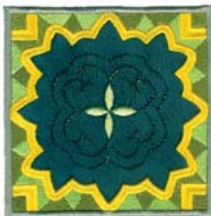
FA687 Blossom 3 3.90 X 3.90 in. 99.06 X 99.06 mm 17,791 St.