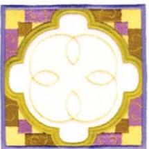
FA686 Knot Garden 3.91 X 3.91 in. 99.31 X 99.31 mm 15,430 St.