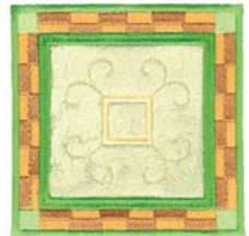
FA689 Garden 3.90 X 3.89 in. 99.06 X 98.81 mm 18,540 St.

⌘ Design contains a loose fill. ⚙ Some white areas shown are not stitched.