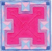
FA678 Geometric 3.90 X 3.90 in. 99.06 X 99.06 mm 18,704 St.