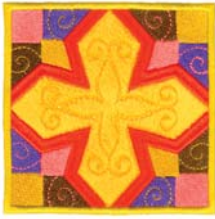
FA670 Crystals 3.91 X 3.92 in. 99.31 X 99.57 mm 20,405 St.