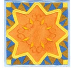
FA673 Sun 3.90 X 3.90 in. 99.06 X 99.06 mm 19,583 St.