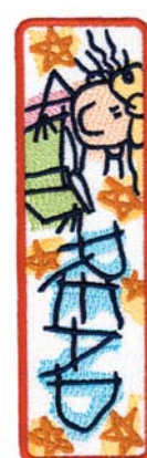
NY147 Kids Drawing 1.90 X 6.11 in. 48.26 X 155.19 mm 24,272 St. L