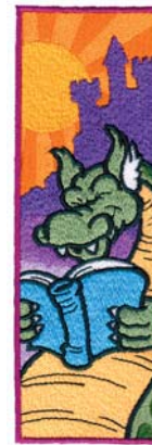
NY134 Dragon 2.01 X 6.02 in. 51.05 X 152.91 mm 25,439 St. L