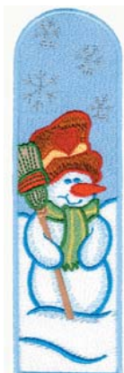
NY146 Snowman 1.76 X 5.99 in. 44.70 X 152.15 mm 21,773 St. L