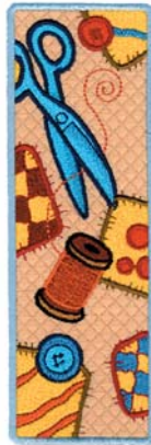
NY138 Sewing 2.08 X 6.22 in. 52.83 X 157.99 mm 31,243 St. L