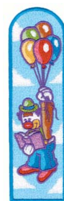
NY148 Clown 1.78 X 6.00 in. 45.21 X 152.40 mm 24,960 St. L