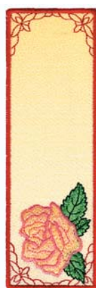
NY145 Roses 2.06 X 6.21 in. 52.32 X 157.73 mm 20,724 St. L