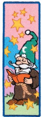
NY135 Little Wizard 2.09 X 6.24 in. 53.09 X 158.50 mm 36,716 St. L