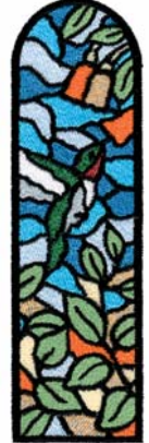
NY142 Hummingbird 1.77 X 6.02 in. 44.96 X 152.91 mm 31,295 St. L