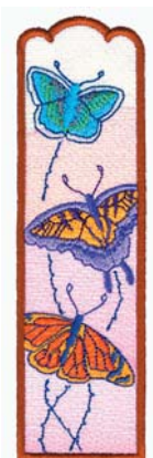
NY143 Butterfly 1.74 X 6.00 in. 44.20 X 152.40 mm 16,100 St. ⌘ L