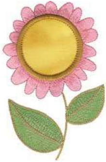
CM351_48 Pink Flower Appliqué 3.52 X 5.48 in. 89.41 X 139.19 mm 16,644 St. ⚡ L

Note: Some designs in this collection may have been created using unique special stitches and/or techniques. To preserve design integrity when rescaling or rotating designs in your software, always rescale or rotate designs using the handles directly on-screen.