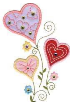
CM191_48 Blooming Hearts Appliqué 3.71 X 5.48 in. 94.23 X 139.19 mm 7,278 St. ✿ L