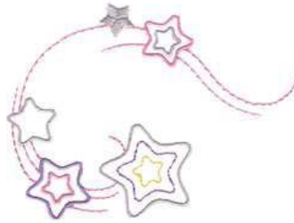
CM366_48 Baby Stars Swirl 4.10 X 3.18 in. 104.14 X 80.77 mm 3,632 St. ⚡