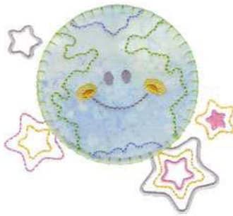
CM377_48 Baby Appliqué Earth 4.16 X 3.84 in. 105.66 X 97.54 mm 4,206 St. ⚡