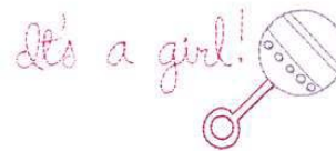
NA665 It's a Girl 4.78 X 2.03 in. 121.41 X 51.56 mm 1,188 St. ⚡