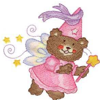
CK899 Fairy Bear Princess 3.81 X 3.90 in. 96.77 X 99.06 mm 17,881 St.