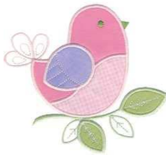
CM500_48 Nursery Bird Appliqué 1 5.10 X 4.59 in. 129.54 X 116.59 mm 7,469 St. ⚡ L