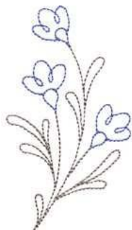
BD687_48 Quilting Garden Delicates 2.20 X 4.03 in. 55.88 X 102.36 mm 1,629 St. ✿