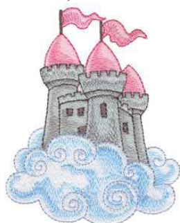
CK901 Castle In The Clouds 3.57 X 4.54 in. 90.68 X 115.32 mm 19,130 St. ✿