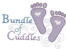
NB200_48 Bundle Of Cuddles 4.03 X 2.89 in. 102.36 X 73.41 mm 10,056 St. ⚡