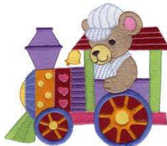
CM344_48 Train Engine 5.55 X 4.90 in. 140.97 X 124.46 mm 31,265 St. ✿ L