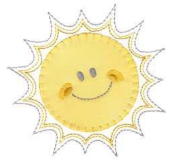
CM376_48 Baby Appliqué Sun 3.95 X 3.84 in. 100.33 X 97.54 mm 2,736 St. ⚡