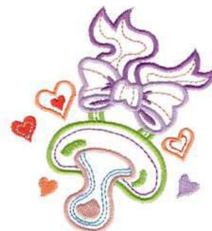
CM036_48 Pacifier 3.43 X 3.85 in. 87.12 X 97.79 mm 7,306 St. ✿