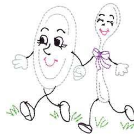
NB464_48 Dish & Spoon 3.57 X 3.61 in. 90.68 X 91.69 mm 2,496 St. ⚡