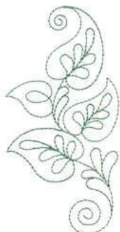
BD562_48 Quilt Leaf Border 2.52 X 4.96 in. 64.01 X 125.98 mm 2,332 St. ✿

Note: Some designs in this collection may have been created using unique special stitches and/or techniques. To preserve design integrity when rescaling or rotating designs in your software, always rescale or rotate designs using the handles directly on-screen.