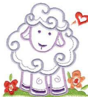
CM026_48 Sheep in Love 3.00 X 3.36 in. 76.20 X 85.34 mm 7,794 St. ✿