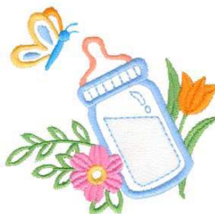
CK752 Bottle 3.50 X 3.33 in. 88.90 X 84.58 mm 8,036 St. ✿