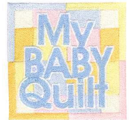
NZ198 My Baby Quilt 2.77 X 2.75 in. 70.36 X 69.85 mm 19,179 St.