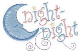
NB202_48 Night Night 3.95 X 2.61 in. 100.33 X 66.29 mm 7,415 St. ⚡