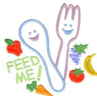
CK753 Feed Me! 3.51 X 3.52 in. 89.15 X 89.41 mm 6,847 St. ✿