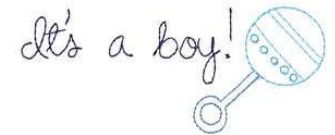
NA666 It's a Boy 4.79 X 2.02 in. 121.67 X 51.31 mm 1,175 St. ⚡