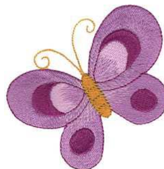
CM349_48 Butterfly 3.38 X 3.48 in. 85.85 X 88.39 mm 10,547 St. ✿

✿ Design contains a loose fill. ✿ Some white areas shown are not stitched.