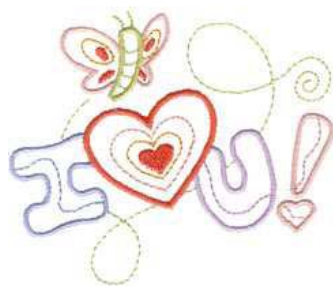
CM160_48 I Heart You Baby 3.83 X 3.23 in. 97.28 X 82.04 mm 5,496 St. ✿