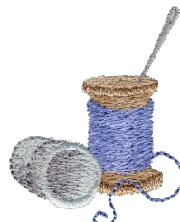
FB157_48 Thimble & Thread

1.84 X 2.38 in. 46.74 X 60.45 mm 4,127 St. ✿