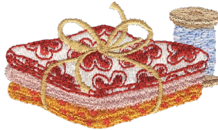
FB152_48 Fat Quarters

3.00 X 1.82 in. 76.20 X 46.23 mm 12,488 St. ✿