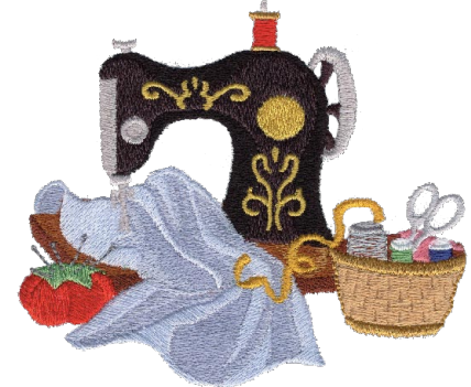
FB153_48 Old Fashioned Sewing Machine

4.56 X 3.99 in. 115.82 X 101.35 mm 23,443 St. ✿