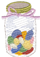
FB154_48 Button Jar

1.83 X 2.63 in. 46.48 X 66.80 mm 5,994 St. ✿✿