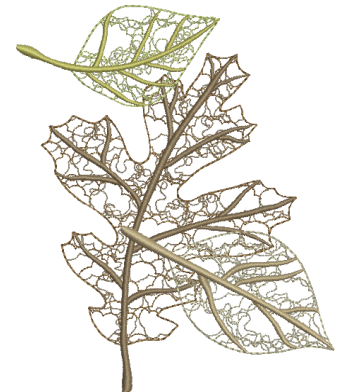
FS372_48 Leaves 3 4.48 X 5.45 in. 113.79 X 138.43 mm 13,708 St. ❄️ L