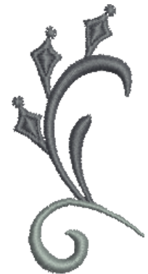
FS384_48 Swirl Element 2 1.19 X 2.42 in. 30.23 X 61.47 mm 1,358 St. S