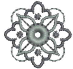
FS380_48 Floral Element Small 1.12 X 1.12 in. 28.45 X 28.45 mm 1,737 St. ❁ S