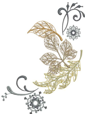
FS385_48 Jumbo Leaf Medley 7.55 X 10.07 in. 191.77 X 255.78 mm 29,421 St. ❁ L

❁ Design contains a loose fill. ❁ Some white areas shown are not stitched.