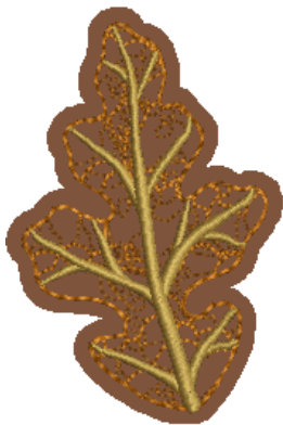
FS369_48 Small Free Standing Appliqué Oak 1.53 X 2.43 in. 38.86 X 61.72 mm 3,015 St. ❄️