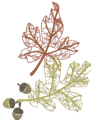
FS374_48 Leaves 5 4.47 X 5.86 in. 113.54 X 148.84 mm 15,003 St. ❄️ L