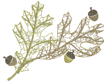
FS371_48 Leaves 2 4.18 X 5.42 in. 106.17 X 137.67 mm 14,248 St. ❄️ L