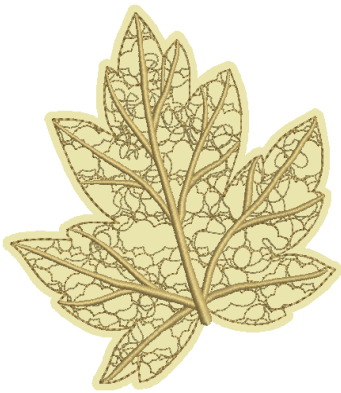
FS365_48 Free Standing Appliqué Maple Leaf 4.08 X 4.65 in. 103.63 X 118.11 mm 9,649 St. ❄️

Note: Some designs in this collection may have been created using unique special stitches and/or techniques. To preserve design integrity when rescaling or rotating designs in your software, always rescale or rotate designs using the handles directly on-screen.