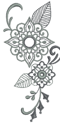
FS379_48 Floral Element 2.42 X 4.03 in. 61.47 X 102.36 mm 8,652 St. ❁