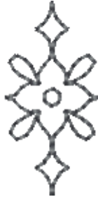
FS378_48 Delicate Border End Piece .69 X 1.40 in. 17.53 X 35.56 mm 371 St. ❁ S