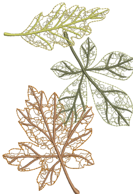
FS370_48 Leaves 1 4.66 X 6.76 in. 118.36 X 171.70 mm 18,890 St. ❄️ L