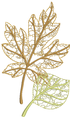
FS373_48 Leaves 4 3.28 X 5.47 in. 83.31 X 138.94 mm 11,969 St. ❄️ L