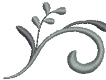
FS383_48 Swirl Element 1 1.98 X 1.44 in. 50.29 X 36.58 mm 1,140 St. S