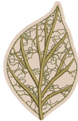
FS367_48 Free Standing Appliqué Aspen Leaf 1.93 X 3.16 in. 49.02 X 80.26 mm 4,383 St. ❄️