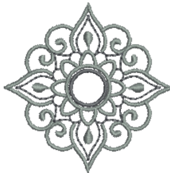
FS382_48 Floral Element Large 2.10 X 2.10 in. 53.34 X 53.34 mm 4,086 St. ❁