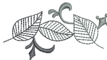
FS375_48 Leaves Accent Border 2.90 X 1.60 in. 73.66 X 40.64 mm 2,414 St. ❄️