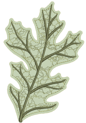
FS368_48 Free Standing Appliqué Oak Leaf 3.52 X 5.50 in. 89.41 X 139.70 mm 9,773 St. ❄️ L