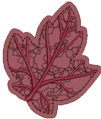
FS366_48 Small Free Standing Appliqué Maple 1.98 X 2.37 in. 50.29 X 60.20 mm 3,826 St. ❄️