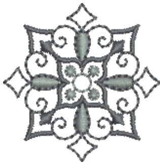
FS381_48 Floral Element Medium 1.59 X 1.59 in. 40.39 X 40.39 mm 2,191 St. ❁