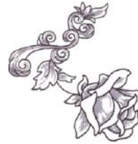
NB513_48 Rose 1 4.08 X 4.40 in. 103.63 X 111.76 mm 5,933 St.