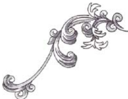
NB525_48 Scrolling Flourish 2 5.33 X 4.02 in. 135.38 X 102.11 mm 5,142 St.