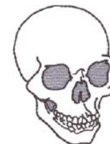
NB533_48 Mini Skull 1.77 X 2.52 in. 44.96 X 64.01 mm 2,267 St.

Design contains a loose fill. Some white areas shown are not stitched.