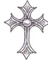
NB518_48 Mini Cross 2.51 X 3.28 in. 63.75 X 83.31 mm 2,789 St.