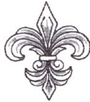
NB512_48 Mini Fleur-De-Lis 2.16 X 2.54 in. 54.86 X 64.52 mm 2,675 St.