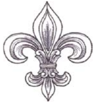
NB510_48 Fleur-De-Lis 1 3.44 X 3.96 in. 87.38 X 100.58 mm 5,037 St.

Note: Some designs in this collection may have been created using unique special stitches and/or techniques. To preserve design integrity when rescaling or rotating designs in your software, always rescale or rotate designs using the handles directly on-screen.