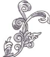
NB526_48 Scrolling Flourish 3 2.71 X 3.58 in. 68.83 X 90.93 mm 3,683 St.