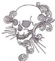
NB530_48 Scrolling Skull 2 4.76 X 5.42 in. 120.90 X 137.67 mm 9,634 St.