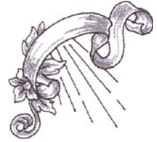
NB519_48 Ribbon 3.21 X 3.13 in. 81.53 X 79.50 mm 3,980 St.