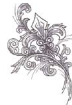
NB523_48 Scrolling Fleur-De-Lis 4.54 X 6.81 in. 115.32 X 172.97 mm 10,564 St.