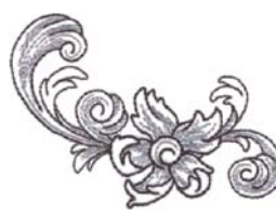
NB527_48 Flower Flourish 3.49 X 2.62 in. 88.65 X 66.55 mm 4,066 St.