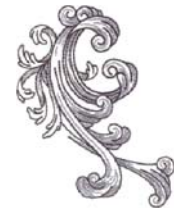
NB524_48 Scrolling Flourish 1 3.43 X 4.45 in. 87.12 X 113.03 mm 6,187 St.