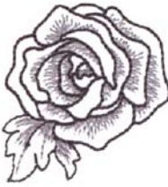
NB515_48 Rose Accent 1.80 X 1.89 in. 45.72 X 48.01 mm 2,837 St.