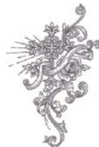
NB522_48 Scrolling Cross 6.69 X 9.60 in. 169.93 X 243.84 mm 19,657 St.