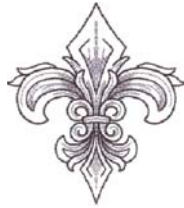
NB511_48 Fleur-De-Lis 2 3.27 X 3.72 in. 83.06 X 94.49 mm 4,671 St.