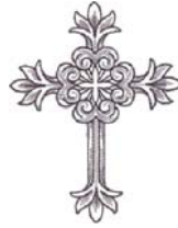
NB517_48 Cross 2 3.62 X 4.75 in. 91.95 X 120.65 mm 6,085 St.