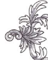
NB528_48 Flourish Leaves 2.14 X 2.87 in. 54.36 X 72.90 mm 2,759 St.