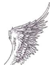
NB532_48 Wing 3.31 X 5.10 in. 84.07 X 129.54 mm 5,259 St.