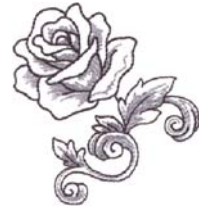
NB514_48 Rose 2 2.83 X 3.08 in. 71.88 X 78.23 mm 4,187 St.