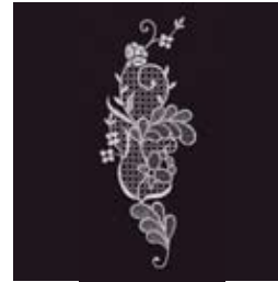
NB473_48 Lovely Accent 2.54 X 6.58 in. 64.52 X 167.13 mm 14,678 St. ⚡⚡ L