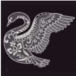
NB465_48 Magnificent Swan 5.80 X 7.52 in. 147.32 X 191.01 mm 44,675 St. ⚡⚡ L