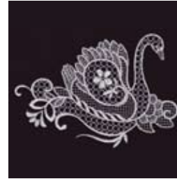
NB478_48 Pretty Swan 3.36 X 4.79 in. 85.34 X 121.67 mm 16,104 St. ⚡⚡