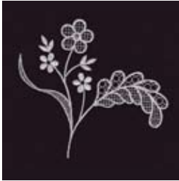
NB475_48 Bouquet 4.50 X 4.05 in. 114.30 X 102.87 mm 8,448 St. ⚡⚡