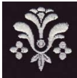
NB482_48 Element 1 1.41 X 1.48 in. 35.81 X 37.59 mm 1,770 St. ⚡ S