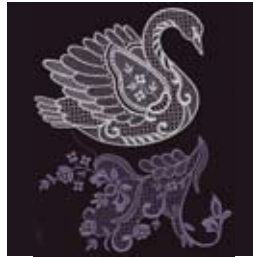
NB472_48 Elegant Combo 6.65 X 8.53 in. 168.91 X 216.66 mm 56,292 St. ⚡⚡ L