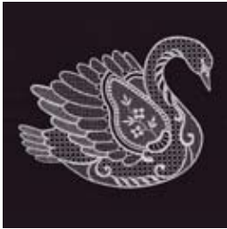
NB470_48 Elegant Swan 4.71 X 6.26 in. 119.63 X 159.00 mm 32,975 St. ⚡⚡ L