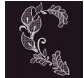
NB474_48 Lily Accent 4.52 X 6.83 in. 114.81 X 173.48 mm 20,186 St. ⚡⚡ L