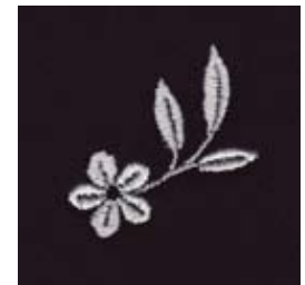
NB484_48 Small Flower 1.32 X 1.24 in. 33.53 X 31.50 mm 969 St. ⚡ S

⚡ Design contains a loose fill. ⚡ Some white areas shown are not stitched.