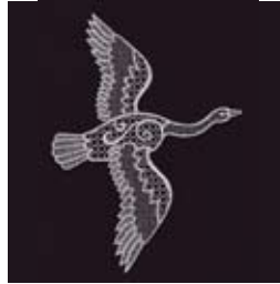
NB477_48 Flying Swan 4.68 X 6.34 in. 118.87 X 161.04 mm 17,142 St. ⚡⚡ L