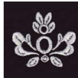
NB483_48 Element 2 1.69 X 1.48 in. 42.93 X 37.59 mm 2,116 St. ⚡ S