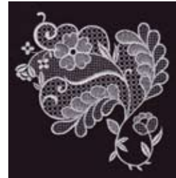
NB468_48 Beautiful Accent 5.34 X 4.93 in. 135.64 X 125.22 mm 24,270 St. ⚡⚡ L