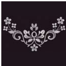
NB481_48 Corner 2.66 X 4.86 in. 67.56 X 123.44 mm 7,048 St. ⚡⚡