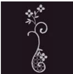
NB480_48 Accent Piece 1.17 X 3.60 in. 29.72 X 91.44 mm 2,858 St. ⚡⚡ S