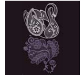
NB469_48 Beautiful Combo 4.94 X 9.74 in. 125.48 X 247.40 mm 52,311 St. ⚡⚡ L