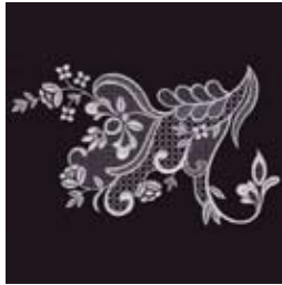
NB471_48 Elegant Accent 3.91 X 6.65 in. 99.31 X 168.91 mm 23,873 St. ⚡⚡ L