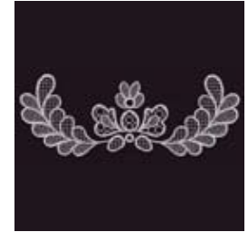
NB479_48 Edge Piece 2.11 X 5.71 in. 53.59 X 145.03 mm 11,728 St. ⚡⚡ L