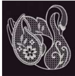
NB467_48 Beautiful Swan 4.91 X 4.94 in. 124.71 X 125.48 mm 27,824 St. ⚡⚡