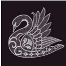
NB466_48 Regal Swan 5.08 X 5.71 in. 129.03 X 145.03 mm 31,281 St. ⚡⚡ L