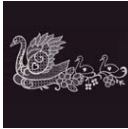
NB476_48 Mother Swan 3.35 X 6.46 in. 85.09 X 164.08 mm 20,676 St. ⚡⚡ L