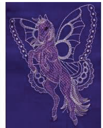
CM272_48 Butterfly Horse 4.19 X 5.76 in. 106.43 X 146.30 mm 9,054 St. ⌘ L