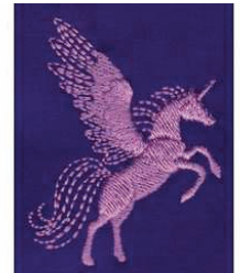
CM282_48 Mini Winged Unicorn 2 2.84 X 2.39 in. 72.14 X 60.71 mm 4,044 St. ⌘

⌘ Design contains a loose fill. ⌘ Some white areas shown are not stitched.