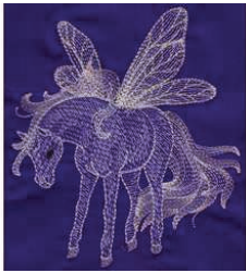
CM273_48 Dragonfly Horse 4.78 X 5.44 in. 121.41 X 138.18 mm 9,116 St. ⌘ L