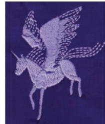
CM281_48 Mini Winged Unicorn 2.10 X 2.48 in. 53.34 X 62.99 mm 4,444 St. ⌘