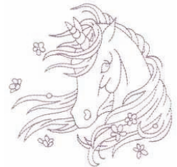
CM277_48 Linework Unicorn with Flowers 5.01 X 5.10 in. 127.25 X 129.54 mm 5,499 St. ⌘ L