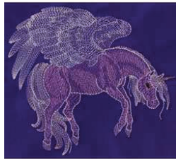
CM269_48 Landing Winged Unicorn 5.97 X 5.38 in. 151.64 X 136.65 mm 11,555 St. ⌘ L