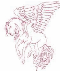
CM276_48 Linework Pegasus 5.50 X 6.29 in. 139.70 X 159.77 mm 6,444 St. ⌘ L