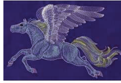
CM265_48 Flying Swiftly 7.51 X 4.92 in. 190.75 X 124.97 mm 12,592 St. ⌘ L