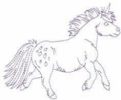
CM278_48 Linework Unicorn Pony 4.83 X 4.04 in. 122.68 X 102.62 mm 3,478 St. ⌘