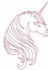
CM275_48 Linework Unicorn Profile 3.69 X 5.12 in. 93.73 X 130.05 mm 3,149 St. ⌘ L