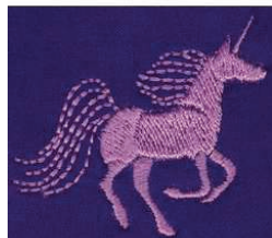
CM280_48 Mini Unicorn 2 1.91 X 1.63 in. 48.51 X 41.40 mm 2,292 St. ⌘