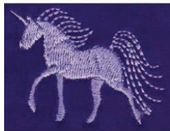
CM279_48 Mini Unicorn 1.96 X 1.38 in. 49.78 X 35.05 mm 2,330 St. ⌘ S