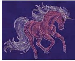
CM264_48 Charging Unicorn 6.32 X 4.95 in. 160.53 X 125.73 mm 10,395 St. ⌘ L