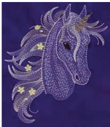
CM268_48 A Noble Unicorn 4.74 X 5.39 in. 120.40 X 136.91 mm 8,078 St. ⌘ L