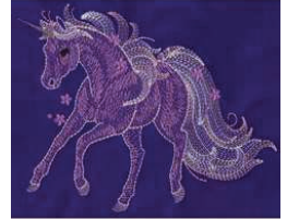
CM267_48 Flower Magic 6.21 X 5.03 in. 157.73 X 127.76 mm 9,934 St. ⌘ L