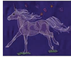
CM266_48 Butterfly Race 6.42 X 5.03 in. 163.07 X 127.76 mm 8,287 St. ⌘ L