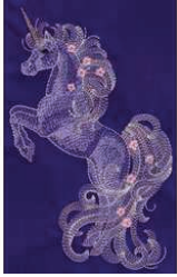
CM263_48 Rearing Unicorn 4.57 X 7.57 in. 116.08 X 192.28 mm 14,568 St. ⌘ L