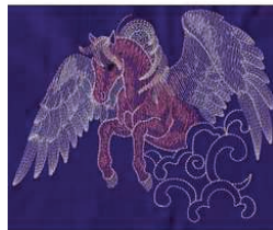
CM270_48 Flying Out of the Clouds 6.42 X 5.31 in. 163.07 X 134.87 mm 11,512 St. ⌘ L