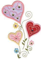
CM191_48 Blooming Hearts Applique 3.71 X 5.48 in. 94.23 X 139.19 mm 7,278 St. ◊ L