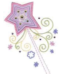
CM210_48 Princess Wand Applique 3.30 X 4.59 in. 83.82 X 116.59 mm 7,207 St. ◊

⌘ Design contains a loose fill. ◊ Some white areas shown are not stitched.