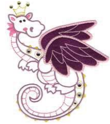
CM195_48 Dragon Prince Applique 4.65 X 5.41 in. 118.11 X 137.41 mm 13,149 St. ◊ L