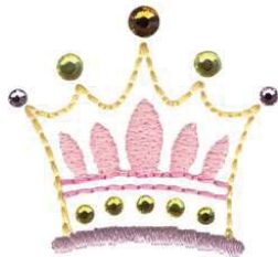
CM206_48 Princess Crown 1.41 X 1.30 in. 35.81 X 33.02 mm 1,243 St. ◊ S