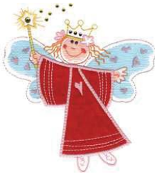
CM196_48 Fairy Princess Applique 4.88 X 5.34 in. 123.95 X 135.64 mm 11,015 St. ⌘ ◊ L