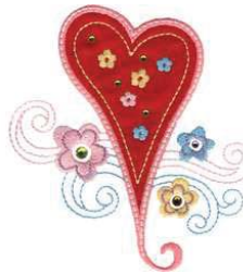
CM198_48 Heart Applique 3.78 X 4.17 in. 96.01 X 105.92 mm 7,939 St. ◊