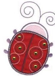
CM199_48 Ladybug Applique 2.82 X 3.88 in. 71.63 X 98.55 mm 4,637 St. ⌘ ◊