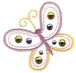
CM205_48 Princess Butterfly 1.76 X 1.74 in. 44.70 X 44.20 mm 1,718 St. ◊