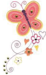
CM192_48 Butterfly Applique 3.00 X 5.41 in. 76.20 X 137.41 mm 6,342 St. ◊ L