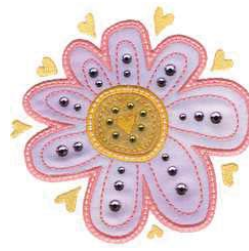
CM194_48 Daisy Applique 3.95 X 3.89 in. 100.33 X 98.81 mm 8,137 St. ◊