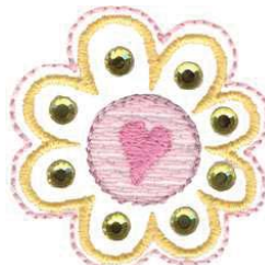
CM208_48 Princess Flower 1.47 X 1.56 in. 37.34 X 39.62 mm 1,826 St. ⌘ ◊ S