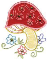
CM201_48 Mushroom Applique 3.04 X 3.89 in. 77.22 X 98.81 mm 8,028 St. ⌘ ◊