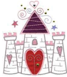
CM193_48 Castle Applique 4.20 X 5.02 in. 106.68 X 127.51 mm 12,530 St. ⌘ ◊ L