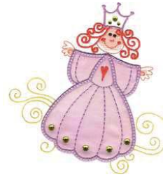
CM204_48 Princess Applique 4.89 X 5.29 in. 124.21 X 134.37 mm 9,353 St. ⌘ ◊ L