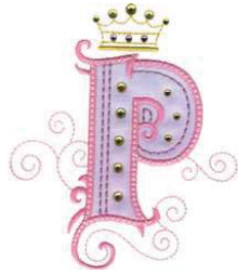
CM202_48 P Applique 3.80 X 4.33 in. 96.52 X 109.98 mm 6,062 St. ◊