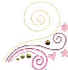
CM209_48 Princess Swirl 2.49 X 2.70 in. 63.25 X 68.58 mm 2,433 St.