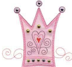
CM207_48 Princess Crown Applique 3.99 X 3.95 in. 101.35 X 100.33 mm 5,366 St. ◊