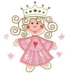
CM200_48 Little Princess Applique 3.69 X 4.31 in. 93.73 X 109.47 mm 9,706 St. ⌘ ◊