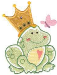
CM197_48 Frog Prince Applique 2.94 X 3.99 in. 74.68 X 101.35 mm 8,182 St. ⌘ ◊