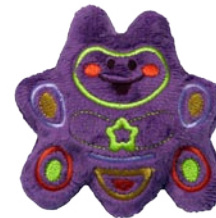
CK845 Glowbug 3.89 X 3.78 in. 98.81 X 96.01 mm 6,652 St. ✿