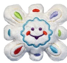
CK854 Fun Shape 2 3.89 X 3.87 in. 98.81 X 98.30 mm 5,082 St. ✿