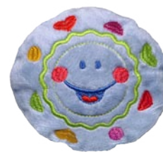
CK855 Circle 3.89 X 3.90 in. 98.81 X 99.06 mm 5,756 St. ✿