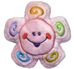
CK841 Flower 1 3.89 X 3.77 in. 98.81 X 95.76 mm 5,690 St. ✿