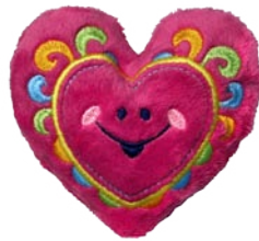
CK849 Heart 3.89 X 3.52 in. 98.81 X 89.41 mm 6,600 St. ✿