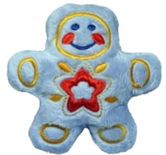
CK856 Astronaut 3.89 X 3.85 in. 98.81 X 97.79 mm 5,898 St. ✿

✿ Design contains a loose fill. ✿ Some white areas shown are not stitched.