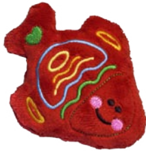
CK848 Fish 2 3.87 X 3.89 in. 98.30 X 98.81 mm 5,067 St. ✿