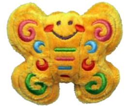
CK846 Butterfly 3.89 X 3.79 in. 98.81 X 96.27 mm 5,970 St. ✿