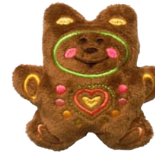
CK850 Teddy 3.89 X 3.83 in. 98.81 X 97.28 mm 6,149 St. ✿