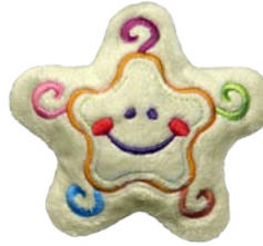
CK839 Star 4.00 X 3.85 in. 101.60 X 97.79 mm 5,584 St. ✿