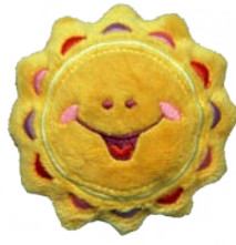
CK838 Sun 3.89 X 3.89 in. 98.81 X 98.81 mm 5,504 St. ✿