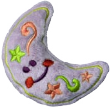
CK837 Moon 3.73 X 3.89 in. 94.74 X 98.81 mm 5,574 St. ✿