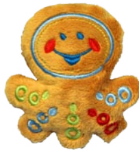
CK843 Octopus 3.86 X 3.89 in. 98.04 X 98.81 mm 6,631 St. ✿