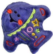
CK847 Fish 1 3.89 X 3.89 in. 98.81 X 98.81 mm 6,413 St. ✿