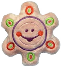
CK842 Flower 2 3.60 X 3.89 in. 91.44 X 98.81 mm 5,731 St. ✿