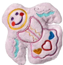
CK852 Angel 3.89 X 3.89 in. 98.81 X 98.81 mm 7,324 St. ✿