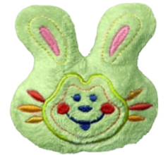
CK851 Bunny 3.74 X 3.89 in. 95.00 X 98.81 mm 5,891 St. ✿