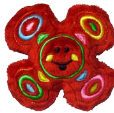
CK853 Fun Shape 1 3.89 X 3.89 in. 98.81 X 98.81 mm 6,825 St. ✿