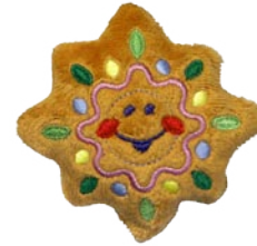
CK840 Starburst 3.88 X 3.89 in. 98.55 X 98.81 mm 4,783 St. ✿