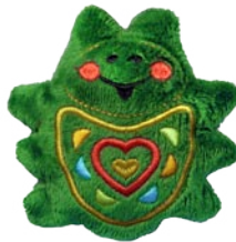
CK844 Bug 3.89 X 3.86 in. 98.81 X 98.04 mm 5,261 St. ✿