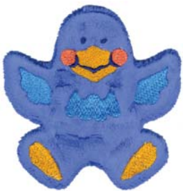
CK441 Birdy 3.97 X 3.93 in. 100.84 X 99.82 mm 5,575 St. ❁