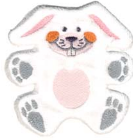
CK428 Bunny 3.78 X 3.89 in. 96.01 X 98.81 mm 6,974 St. ❁