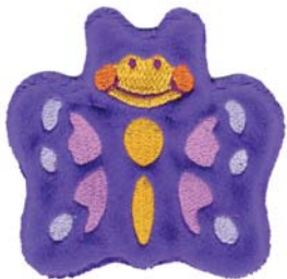
CK436 Butterfly 3.98 X 3.81 in. 101.09 X 96.77 mm 6,239 St. ❁