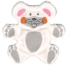
CK430 Mousey 3.85 X 3.88 in. 97.79 X 98.55 mm 7,194 St. ❁