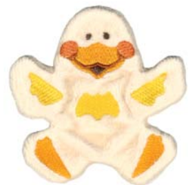
CK440 Ducky 3.99 X 3.89 in. 101.35 X 98.81 mm 4,936 St. ❁