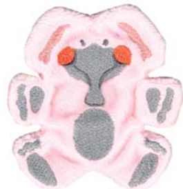
CK443 Elephant 3.67 X 3.87 in. 93.22 X 98.30 mm 6,770 St. ❁