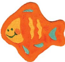
CK437 Fishy 3.99 X 3.51 in. 101.35 X 89.15 mm 4,922 St. ❁