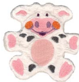
CK439 Cow 3.77 X 3.88 in. 95.76 X 98.55 mm 6,891 St. ❁