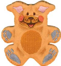
CK427 Doggy 3.56 X 3.89 in. 90.42 X 98.81 mm 7,230 St. ❁