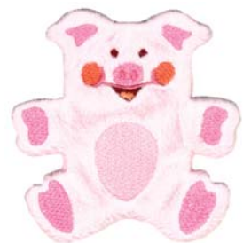
CK445 Piggy 3.79 X 3.88 in. 96.27 X 98.55 mm 5,487 St. ❁