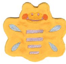
CK434 Bee 3.80 X 3.60 in. 96.52 X 91.44 mm 4,994 St. ❁