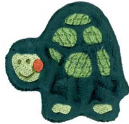
CK438 Turtle 3.98 X 3.64 in. 101.09 X 92.46 mm 6,652 St. ❁