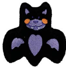
CK433 Batsy 3.87 X 3.82 in. 98.30 X 97.03 mm 4,972 St. ❁