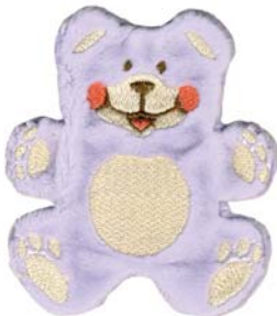
CK431 Teddy 3.55 X 3.87 in. 90.17 X 98.30 mm 6,438 St. ❁