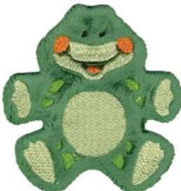
CK442 Froggy 3.87 X 3.78 in. 98.30 X 96.01 mm 6,862 St. ❁