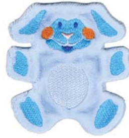
CK429 Lamb 3.76 X 3.88 in. 95.50 X 98.55 mm 7,525 St. ❁