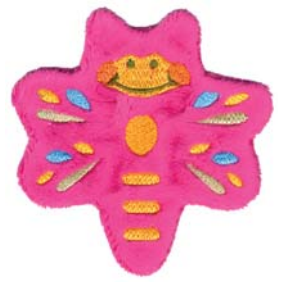
CK435 Dragonfly 4.00 X 3.99 in. 101.60 X 101.35 mm 5,881 St. ❁