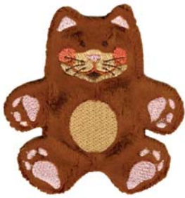
CK426 Kitty 3.70 X 3.87 in. 93.98 X 98.30 mm 6,347 St. ❁