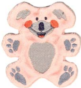
CK432 Koala 3.58 X 3.88 in. 90.93 X 98.55 mm 6,809 St. ❁